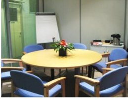
Conference Room 2 – Ground Floor. Seating for up to six people. (Picture not included)