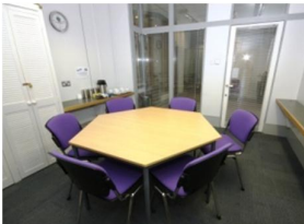
Conference Room 5 – Ground Floor. Seating for up to six people.