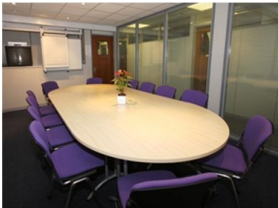
Conference Room 4 – Lower Ground Floor. Seating for up to twelve people with flexible table arrangements to suit meetings, training or discussion groups, or conference style seating for up to twenty people. The room is equipped with TV, video and DVD player. Tea, coffee and biscuits for up to twelve people included. Prices for larger numbers on request.