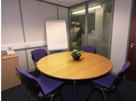
Conference Room 3 – Lower Ground Floor. Seating for up to four people.